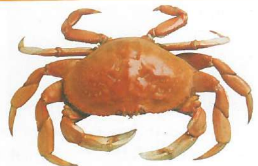
The CDSS community mobilizers encouraged Afshan to avail loan facility